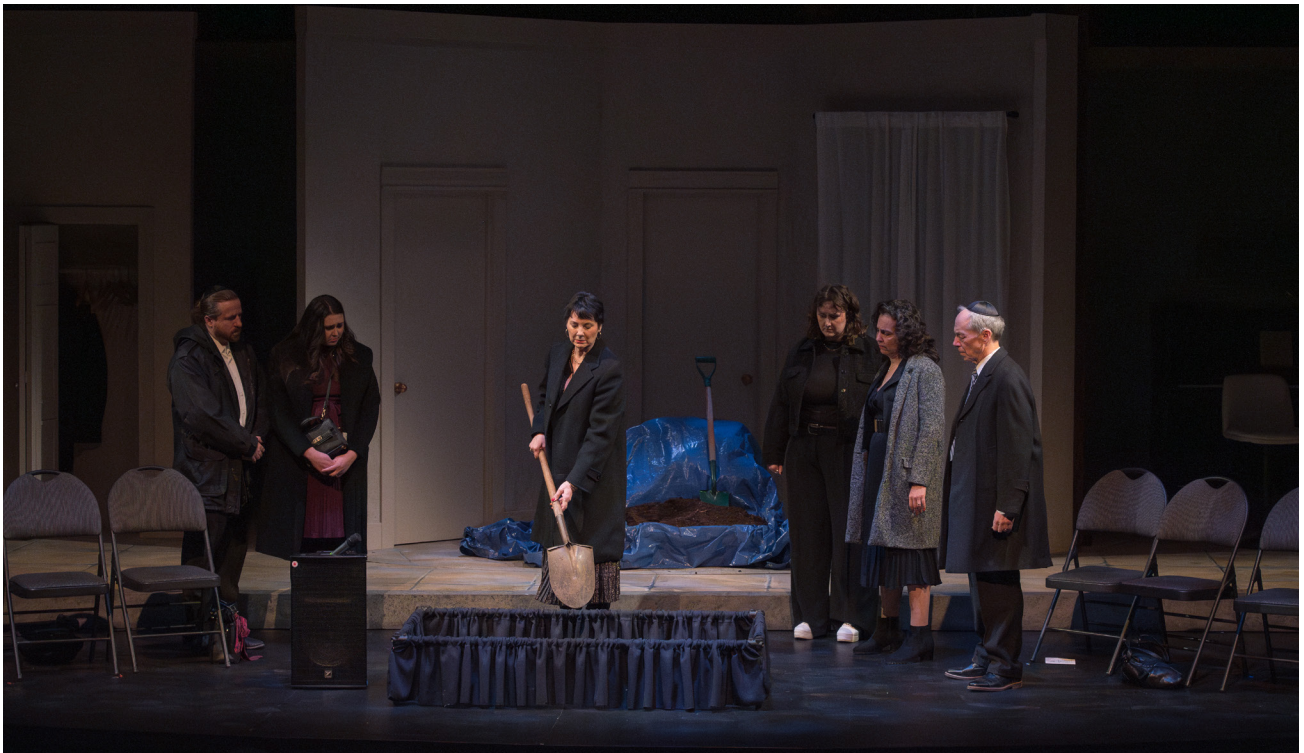
This is the stage during the show.