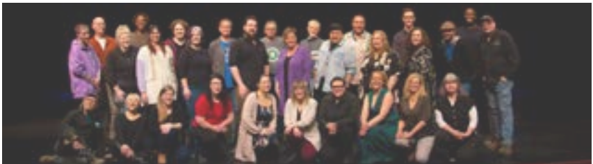
Photo of Persephone Theatre 2022-2023 Staff